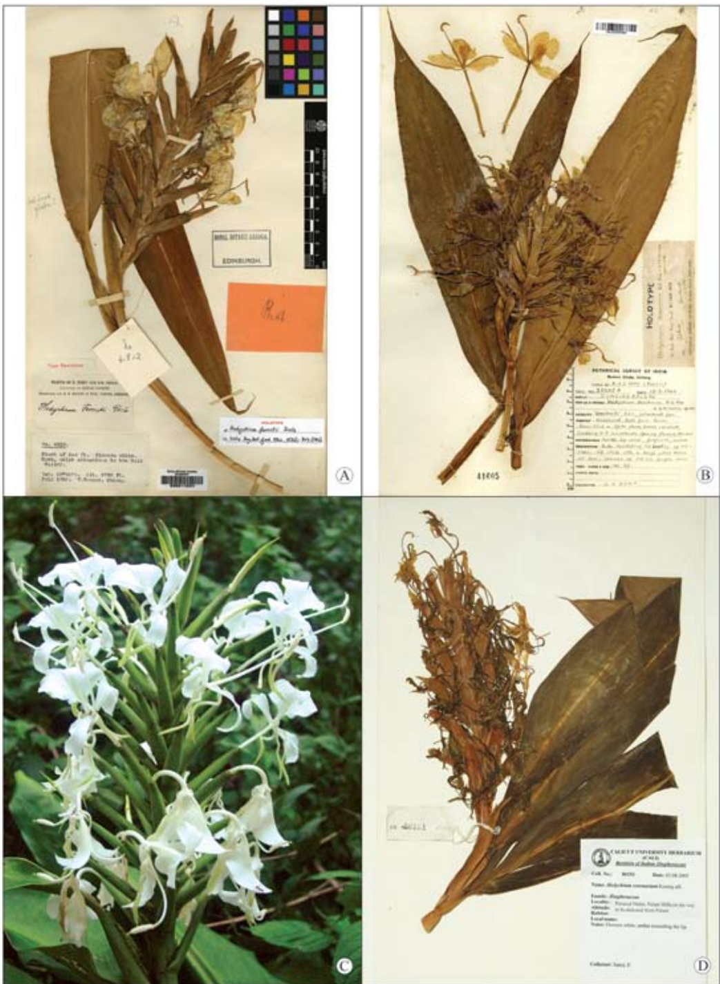
FIG. 2. A. Hedychium forrestii . Type specimen (G. Forrest 4812), reproduced with kind permission from Botanic Garden Edinburgh. B. Hedychium dekanium . Type specimen (G.K. Deka 35605). C. Hedychium forrestii (E. Sanoj & T. Rajesh Kumar 94905), photo by E. Sanoj. D. Hedychium forrestii var. palaniense . Type specimen (E. Sanoj 86151).