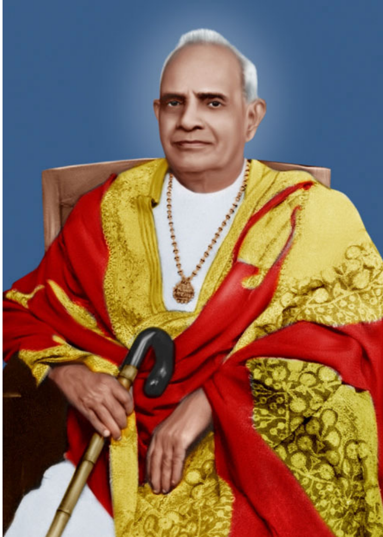
PADMABHOOSHAN BHARATA KESARI MANNATHU PADMANABHAN (1878-1970)

മഹിത സേവന മന്ദാരദാരുവിൽ മലർവിരിച്ച മരതകച്ചായയിൽ അവശലോകത്തെയാനയിച്ചാനയി- ച്ചവയിയില്ലാത്ത ശാന്തിയേകി സ്വയം അനുദിനം മാനവോൽക്കർഷ പൂർത്തിത- ന്നടിയുറപ്പിനായർപ്പിച്ചു ജീവിതം വിലസുമുജ്വല നായകതാരക വിമലഹീരമേ നീണാൾ ജയിക്ക നീ (ചങ്ങമ്പുഴ കൃഷ്ണപിള്ള)